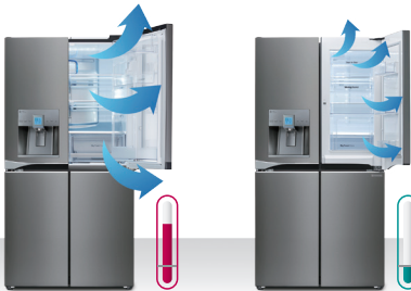
Open upper-right door

You can store your food fresher for longer with LG Door-in-Door™.